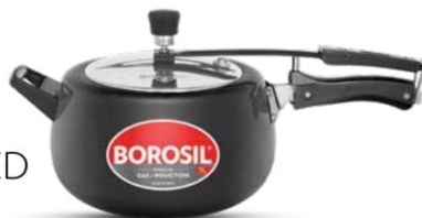
PRONTO - HARD ANODISED SS LID PRESSURE COOKER