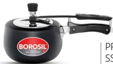
PRONTO - HARD ANODISED SS LID PRESSURE COOKER