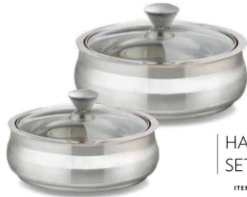
HANDI SERVER SET OF 2